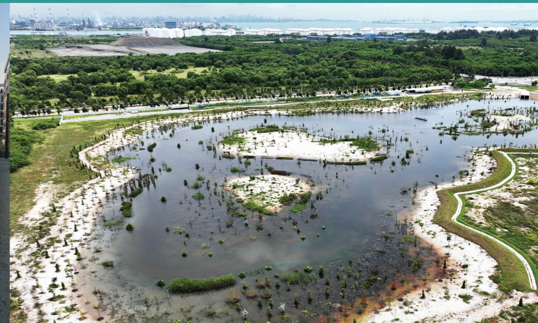
Jurong Island Waterbody