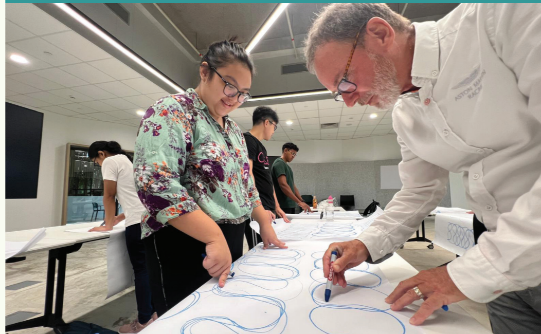
NUS Cities, Singapore