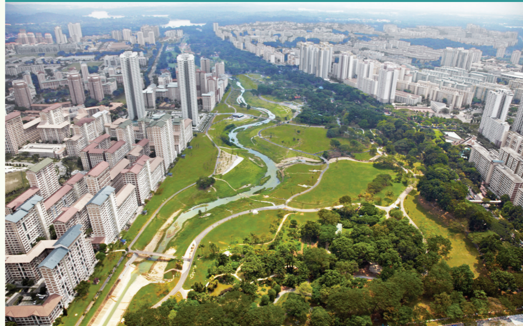
Bishan-Ang Mo Kio Park