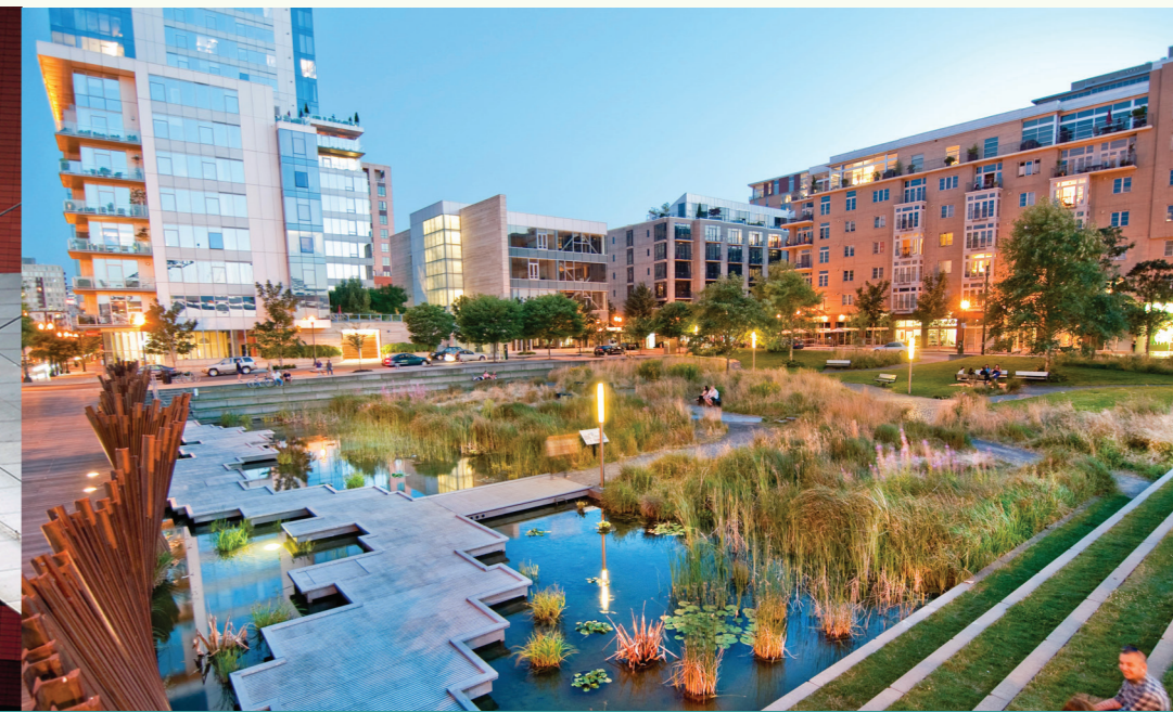
Tanner Springs Park