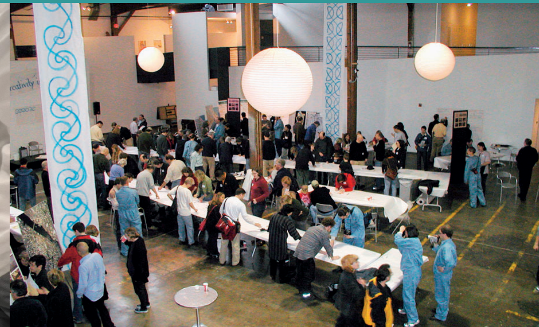
Public Participation Workshop, Portland, Oregon