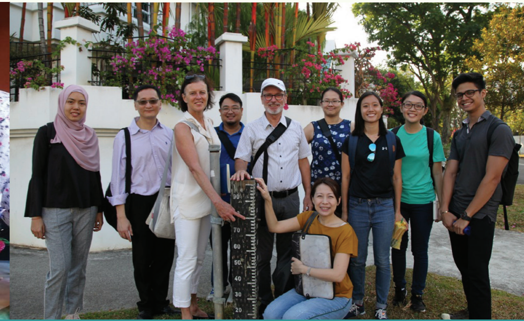
Building Community Resilience, Singapore