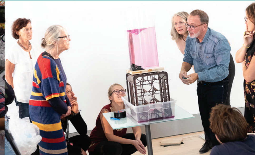
Globart Academy, Vienna