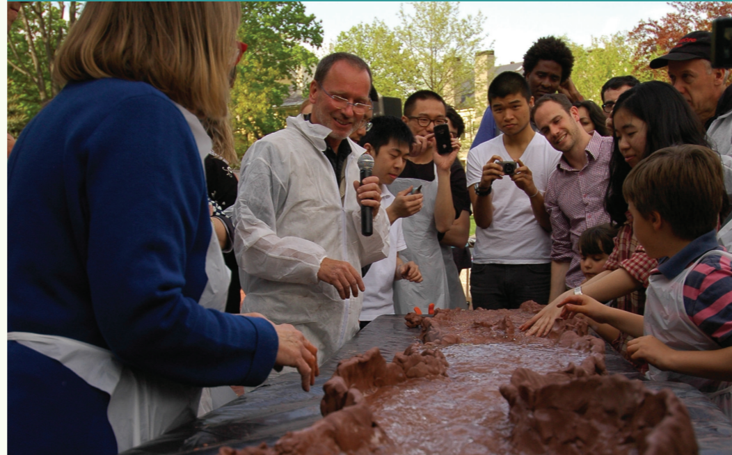
Harvard University Graduate School Of Design