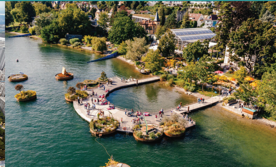
Floating Gardens, LGS