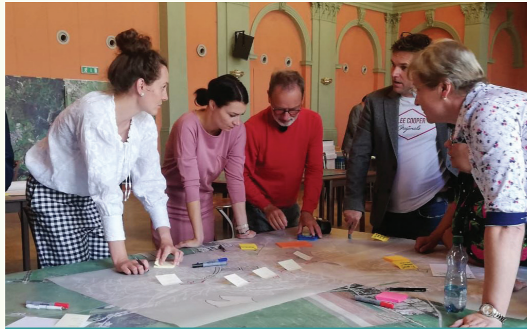
Bridging the Gap, Vision for Bruntál 2070